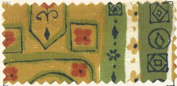
Simplicity Pattern No. 2073

"SUTTALINA" by WAMSUTTA...100% cotton fabric with a nubby texture interest, crease resistant and requiring little or no ironing. This print is available in combinations of green and gold, blue and green, brown and lavender. Suttalina is part of the "American Scene" Wamsutta group of fabrics inspired by the American way of life.